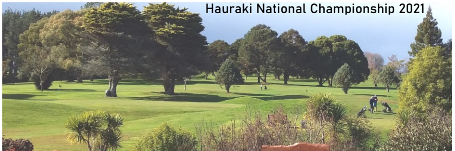
Hauraki National Championship 2021

The 2021 nationals were a resounding success thanks to the hard work of the committee and the fact that the Hauraki Golf Club members took this tournament on as a positive week for their club.